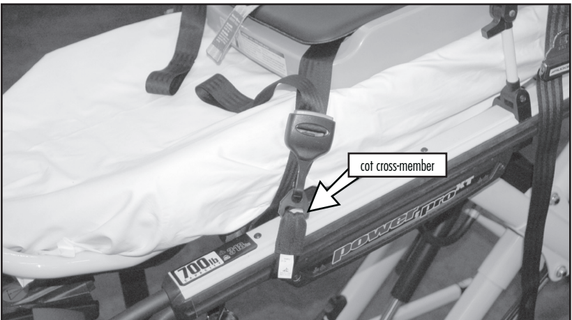
Stryker Power Cot Installation